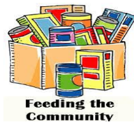
Feeding the Community

HOPE Food Pantry - Please bring your nonperishable DRY GOODS with you to Mass. HOPE suggests: tea, soup, cereal, jelly, peanut butter, canned stew, soup, rice, powdered milk, juice, tuna, pasta, tomato sauce, beans and hash. Also: shampoo, soap, and toiletry items, as well as brown bags and plastic grocery bags in which to put food for distribution. Please do not donate opened food packages or food with an expired "use before" date.